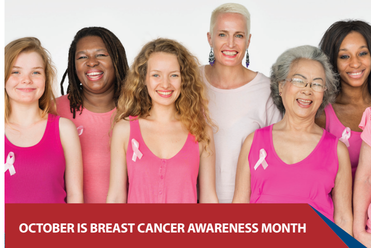
OCTOBER IS BREAST CANCER AWARENESS MONTH