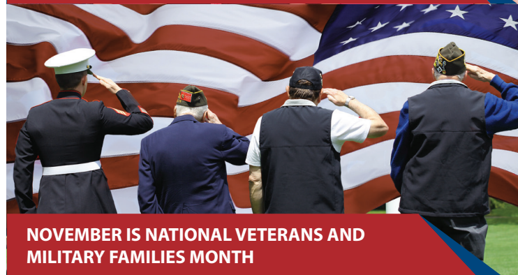
NOVEMBER IS NATIONAL VETERANS AND MILITARY FAMILIES MONTH