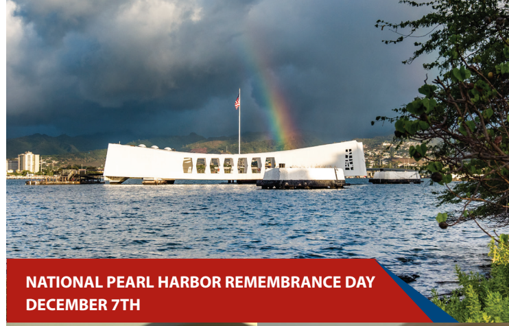
NATIONAL PEARL HARBOR REMEMBRANCE DAY DECEMBER 7TH