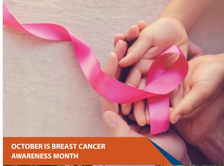
OCTOBER IS BREAST CANCER AWARENESS MONTH