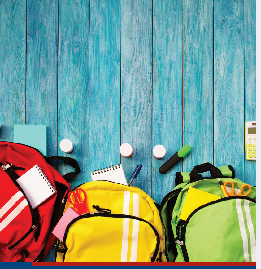
Don't Forget Your School Supplies!